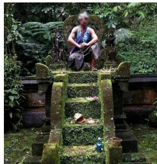
Figure 1 A Danish tourist climbing the shrine on Pura Luhur Batukaru

conation, the violation of social norm and spiritual belief of the islanders.