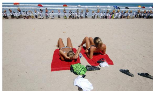
Foreign tourists at Kuta beach watch Balinese people carry offerings for the Melasti ceremony, a Hindu purification ritual.