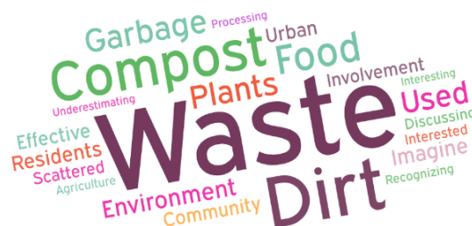
Diagram 2. Answer the question: is there a regional condition that you imagined while making this work?