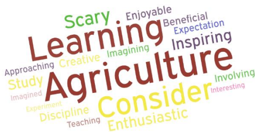
Diagram 5. Answers to the question of whether your views on chemistry changed during the creation of this work?

During the results testing phase, each group presented the products they had created. In general, the products were similar in type, but there were variations in creativity and the way ideas were conveyed. This indicates differences in creative thinking abilities among students. The students' reflections in Diagram 4 show that most students felt happy, interested, and more engaged in the learning process, despite facing some challenges. These findings indicate that project-based learning is capable of creating positive learning experiences and increasing student engagement. These results align with those of Maulidiningsih (2023), Simanjuntak (2023), and Hapsari (2021), who state that PjBL can increase student motivation and participation in learning.