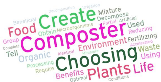
Diagram 1. The answer to the question of what work your team created and why you made that work?

As part of the process of identifying key questions, the researcher posed questions related to the concept of green chemistry to assess students' initial understanding. Based on the observation results, students actively responded, but the understanding they demonstrated was still limited. These findings indicate that students have not yet comprehensively understood the concept of green chemistry. After the lesson, students' reflections showed a shift in understanding, as they began to view chemistry as a more contextual and meaningful science in daily life.