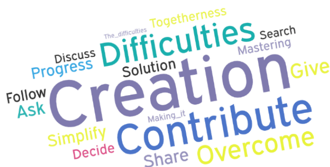
Diagram 3. Answers to the question of what difficulties you faced in creating this work and how you overcame those difficulties?

During the project planning phase, students were divided into several groups to design a waste treatment project. Observation results indicate variations in group discussion dynamics influenced by students' cultural backgrounds. These findings suggest that culture influences students' thinking and decision-making when designing solutions. This is supported by students' reflection data in Diagram 1 and Diagram 2, which show that most groups chose to build composters and linked the project to real-world environmental conditions, such as household organic waste management and agricultural activities. These findings demonstrate that students are able to relate the concept of green chemistry to real-life contexts based on local culture. These results align with Utomo (2024), Simanjuntak (2019), and Kustiyah (2024), who state that PjBL promotes context-based, environment-oriented problem-solving.