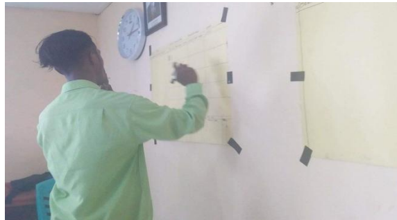
Figure 5. The committee counted the votes

Based on figure 5.5, it shows that in the voting of the members of the Village deliberative Bodies in Central Wologai Village, there is openness in the democratic process. The vote counting process by the committee for the election of members of the Village Deliberative Bodies is carried out openly in front of the community. The committee together with the community conducted a recapitulation to find out who got the most votes and became a people's representative who was believed to be able to capture the aspirations of the people of Central Wologai Village.