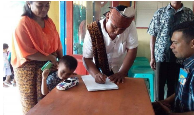
Figure 2. Voters Fill Out the Attendance List for the Election of Candidates for Members of the Village Deliberative Bodies

Based on figure 5.2 above, it can be seen that voters are filling out the attendance list to elect candidates for members of the Village Deliberative Bodies, by filling out the attendance list, the number of voters who come to vote can be known. The filling of the attendance list is to match the votes obtained by each candidate for the Village Deliberative Bodies at the time of vote counting later. This is a way to minimize cheating or mistakes that can occur.