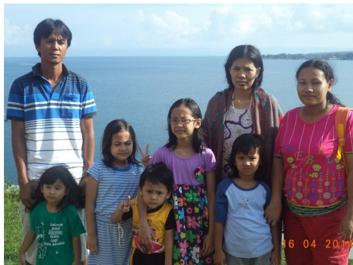
Image 4. At Samosir Island, April 16, 2014

Indonesia has had 4 (four) other sites UNESCO Global Geopark, namely: Batur, Cileteuh, Gunung Sewu, and Rinjani, beside the infamous Toba Caldera. Indonesia also has a lot of natural and cultural resources are included in the UNESCO list include ten cultural heritage objects, 9 (nine) cultural and natural heritage sites, and 16 (sixteen) biosphere reserves that have been listed in UNESCO.