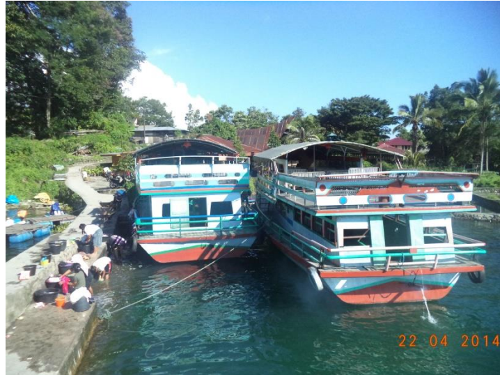
Image 3. Local people daily activities, April 22, 2014

In fact, the Toba caldera designation as a UNESCO Global Geopark is a long process of joint efforts of various stakeholders, including local and central government together with local people who live in the area of Lake Toba.