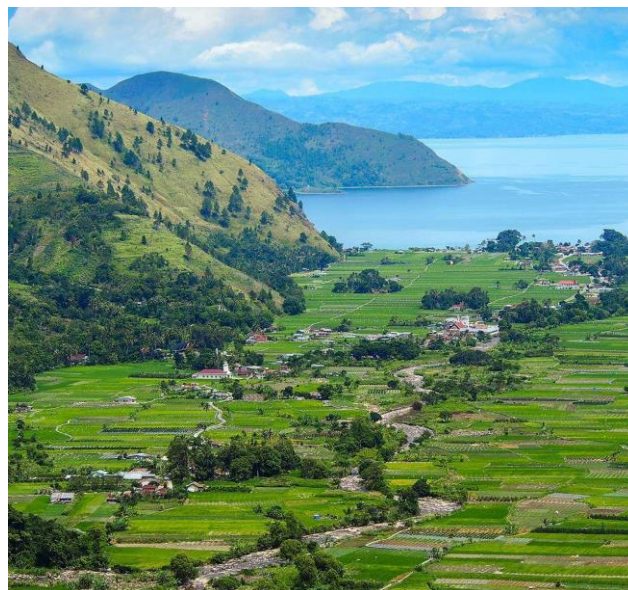
Image 1. Toba Caldera Scenic Panorama

Source: (Indonesia Ministry of Foreign Affairs 2020)