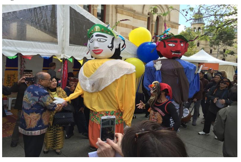
Figure 1. Ondel-Ondel Betawi in the event Indofest di Adelaide