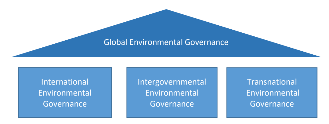
Figure 1. Global Environmental Governance

Transgovernmental governance is a hybrid form that sub-national actors and sub-governmental bodies can work beyond borders to address global problems. Multi-stakeholder initiative is an example of transnational governance. This research learned from Dingwerth's global governance by advising three types of global environmental governance namely international environmental governance, transgovernmental environmental governance and transnational environmental governance.