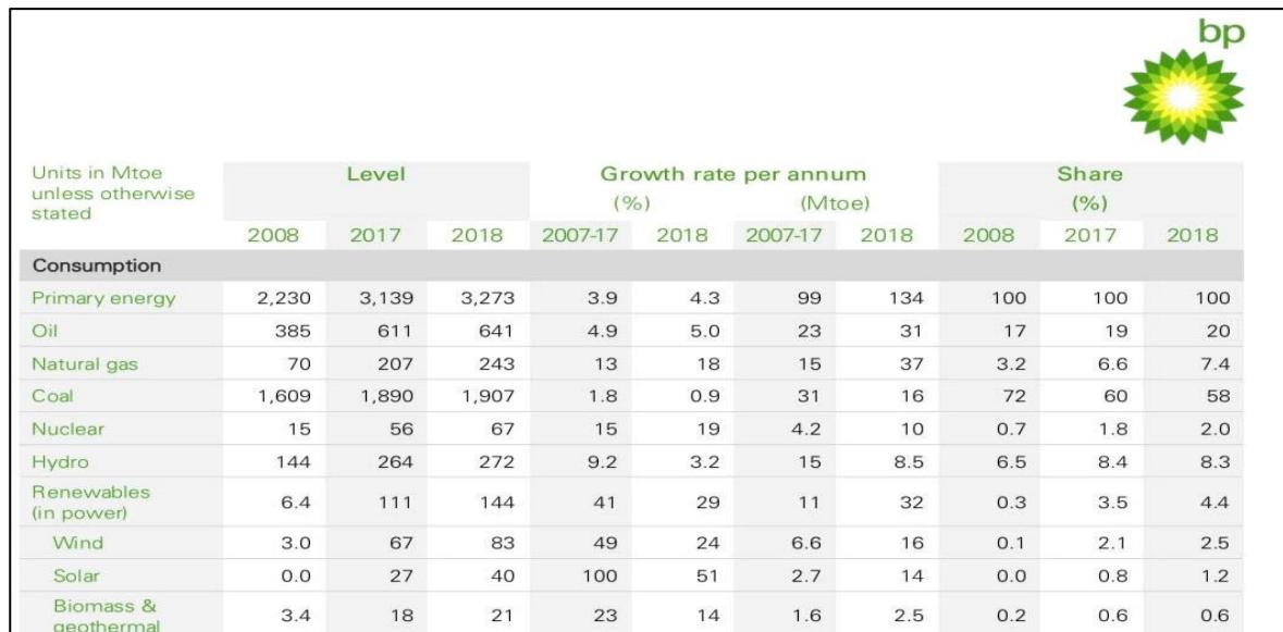
Table. 1 China’s Primary Energy Consumption