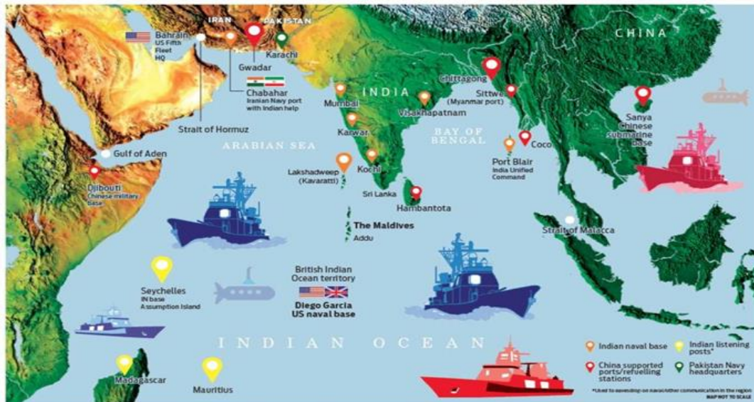
Image. 2 China’s Port in the Indian Ocean

Source: www.hitbrother.com/chinese-military-bases-in-the-indian-ocean-region-ior/