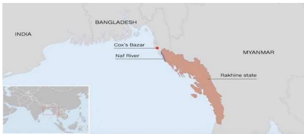
Figure 4: Maps of Maritime Border between Bangladesh and Myanmar