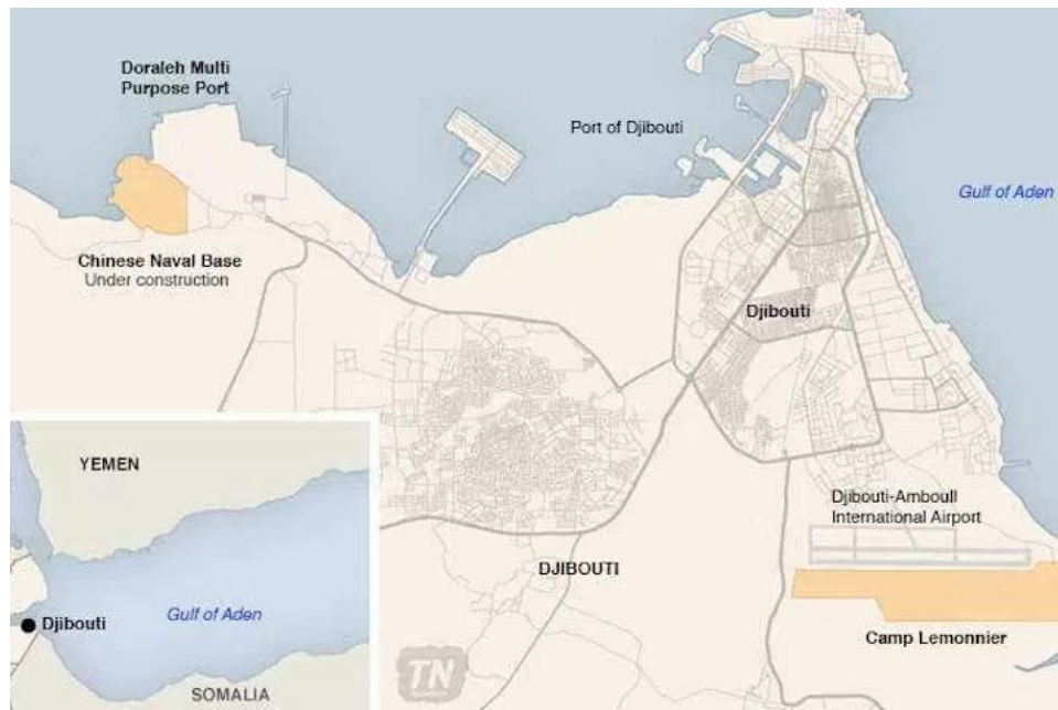
Image. 3 Chinese Naval Base in Djibouti

Source: www.globalsecurity.org/military/world/djibouti/forrel-prc-base.htm