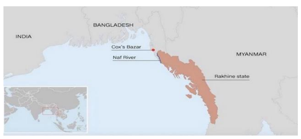
Figure 4: Maps of Maritime Border between Bangladesh and Myanmar

Enhancing Bangladesh's naval capabilities also becomes China's necessity to keep growing maritime presence in Bangladesh. From 1980s Bangladesh navy has been equipped by China frigates and missile boats. And in March 2017, Bangladesh purchased two Ming-class boats from China. With China's help, Bangladesh is also developing a new submarine base in Cox's Bazar (Davis and Anthony, 2020). It can be seen in figure 4 (below), Cox's Bazar is located near the maritime border between Bangladesh and Myanmar. In Rakhine State, there is Kyaukpyu Port that is also being developed by China. Growing China's maritime presence between Bangladesh and Myanmar in the long-standing Bangladesh – Myanmar maritime boundary dispute will open up a new possibility of peaceful resolution for both countries. As China's State Councilor, Wang Yi stated "As a friend of China and Bangladesh, China will provide peace assistance within the capacity." (Xinhua, 2019).